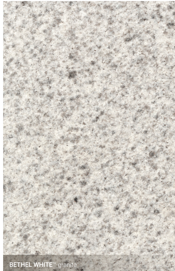
BETHEL WHITE™ granite

In terms of both color and structural integrity, BETHEL WHITE™ is unparalleled. Its durability ensures it remains impervious to typical environmental challenges such as ice, salt, and freeze-thaw cycles, ensuring longevity even in harsh conditions. This granite's consistency and resilience made it the preferred choice for mammoth projects, such as the Abu Dhabi National Oil Company's facade, which demanded 3,500 cubic meters of this granite over four years.