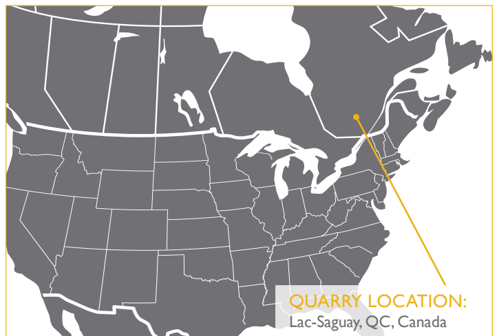
QUARRY LOCATION: Lac-Saguay, QC, Canada