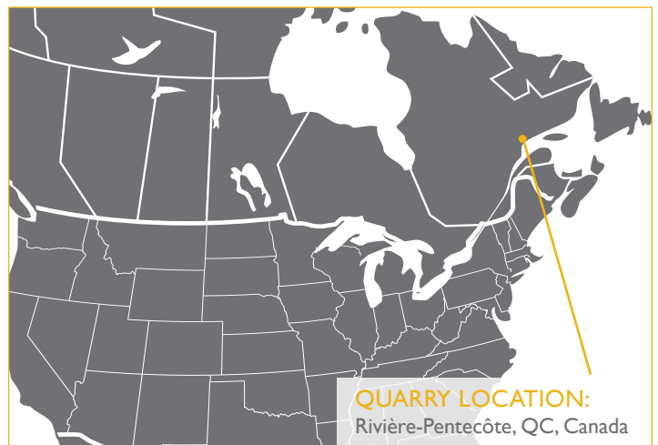
QUARRY LOCATION: Rivière-Pentecôte, QC, Canada