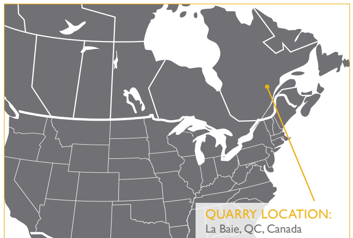
QUARRY LOCATION: La Baie, QC, Canada