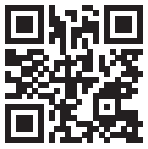
Scan me for more info.