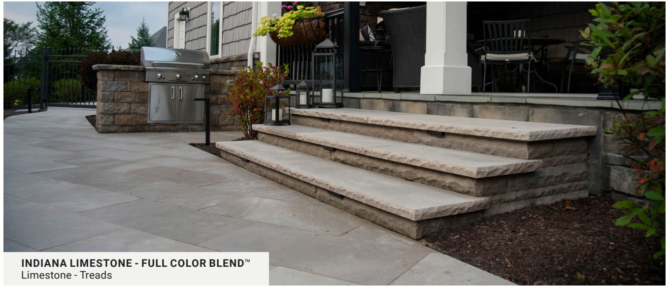
INDIANA LIMESTONE - FULL COLOR BLEND™ Limestone - Treads

Natural stone treads add a luxury finish to standard steps. They are perfectly adapted to northern climates, widely sought after for their superior strength and durability.