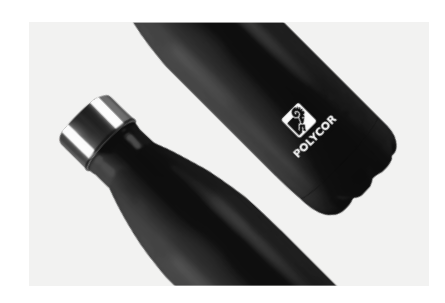
Reusable Water Bottle