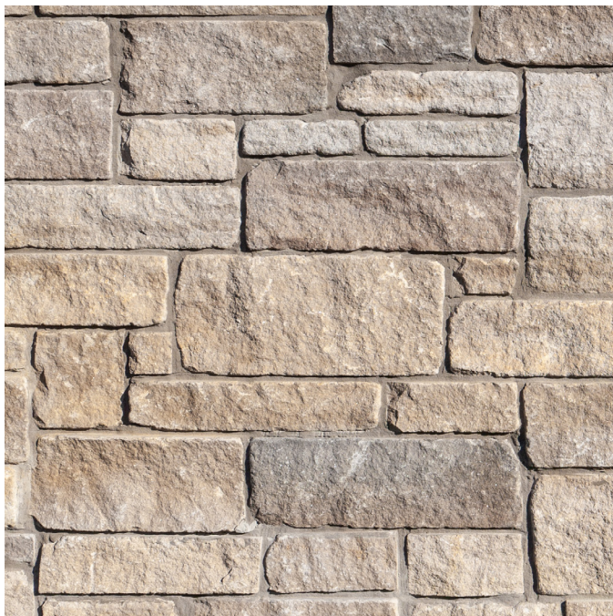
Rockford Estate Blend™ thin stone veneer

To address these challenges, Padula turned to Polycor and Indiana Limestone as the primary material for the home's exterior. The stone's natural properties, domestic production, and resilience proved ideal for tackling the challenges head-on.