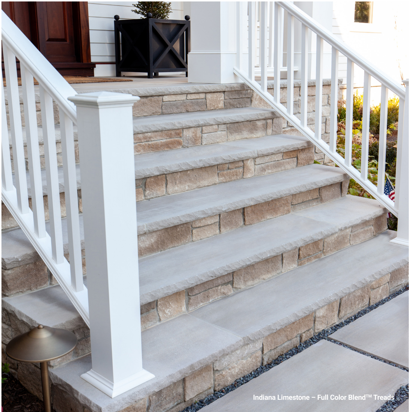
Indiana Limestone – Full Color Blend™ Treads